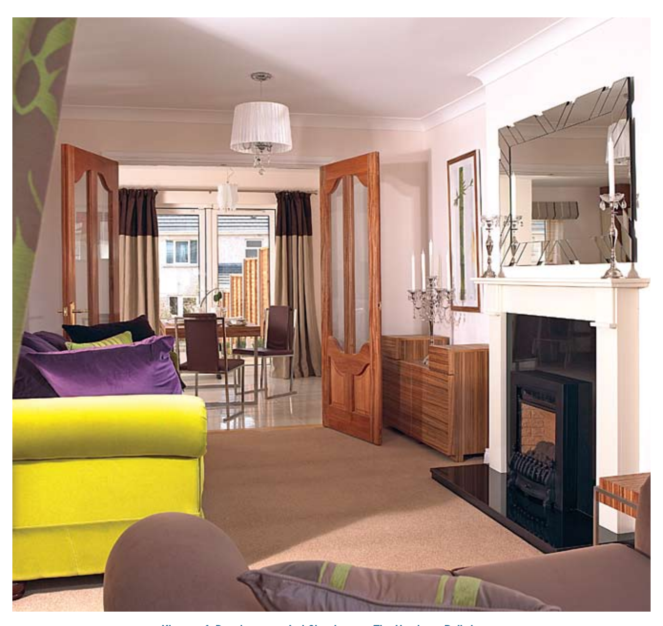
Kingscroft Developments Ltd Showhomes: The Hastings, Balbriggan, Holywell, Kilcoole and Castlegate, Portarlington